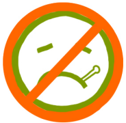
If you feel sick please STAY HOME!