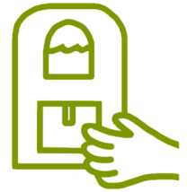
Hand sanitizing stations