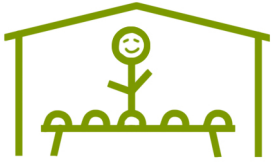
Many of our normal vendors