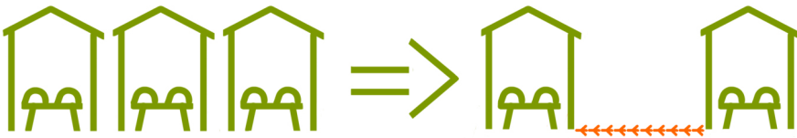
Creating extra space between vendors