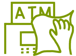
Doing extra sanitation