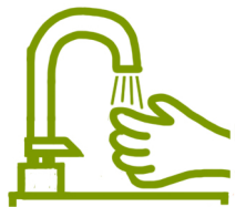
Wash your hands!