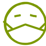
Consider wearing a face mask