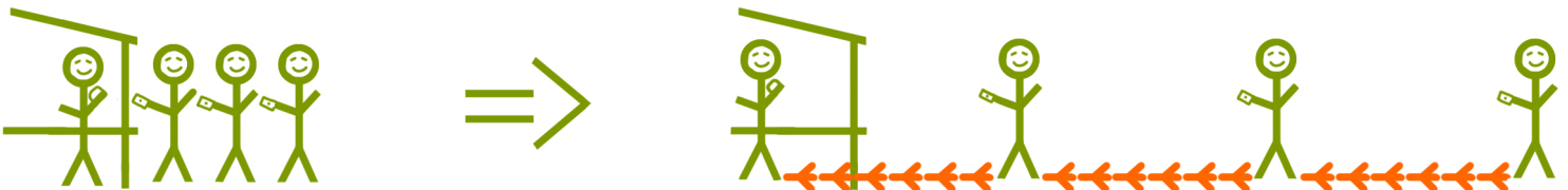
Keep at least 6 giant Chicken feet between you and those around you